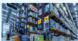
Warehouse owners/ operators