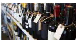
Liquor & Wine