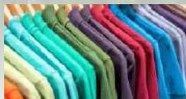
Textiles & Apparels