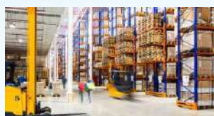
Material Flow Solutions