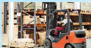
Material Handling Equipment