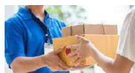
Delivery & Last Mile