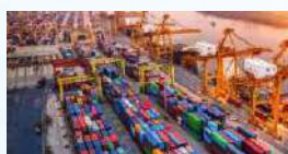
Ports, Railways & Terminals