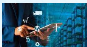
Supply Chain Visibility