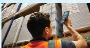
AIDC, RFID & IoT