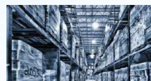
Cold Chain & Temperature -Controlled Storage