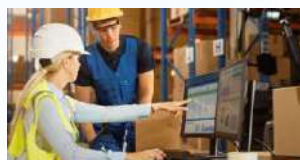
Inventory Optimization Solutions