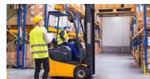
Safety & Security