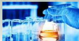
Chemicals & Petrochemicals