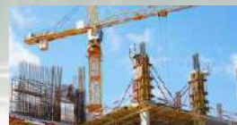
Infrastructure & Construction