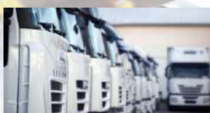
Commercial Vehicles & Transport