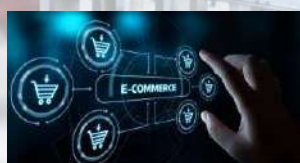
E-commerce & Fulfillment Solutions