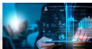
Data Analytics and Artificial Intelligence (AI)