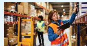
Warehouse Management Software (WMS)