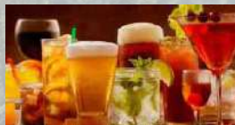
Food/Beverages & FMCG