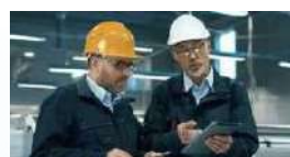
Supply Chain Consultants