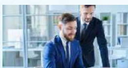
Real Estate Owners/ brokers