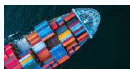
Shipping & transportation