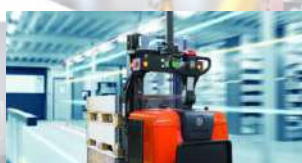
Hybrid and Alternative Fuel Vehicles