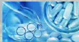
Pharma & Healthcare