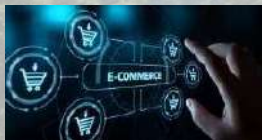
E-Commerce & Retail