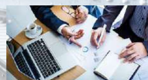
Consulting and Services