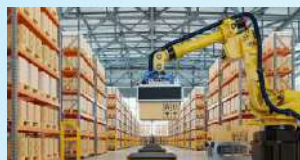
Logistics Automation & Robotics