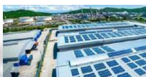
Energy Efficiency & Sustainability