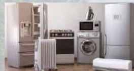
Electronics & Consumer Durables