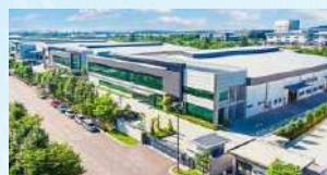
Warehouse Developers & Industrial Parks