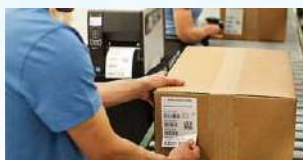
Packaging & Labeling for Logistics