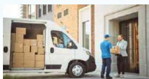
Urban and Last-Mile Logistics