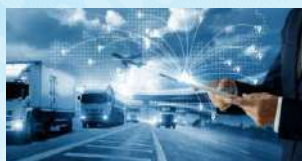
Logistics & Supply Chain