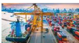
Cargo, Logistics & Supply Chain