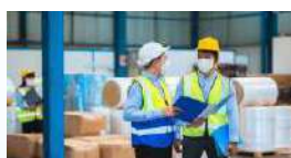
Factory & Warehouse Consultants