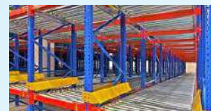
Storage & Racking Solutions