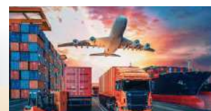
Reverse Logistics and Recycling Solutions