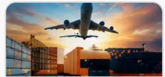
Reverse Logistics and Recycling Solutions