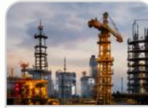
Infrastructure & Construction