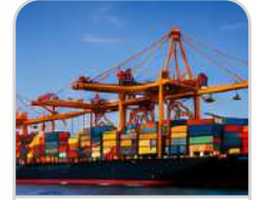
Cargo, Logistics & Supply Chain