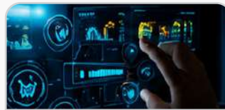
Data Analytics and Artificial Intelligence (AI)