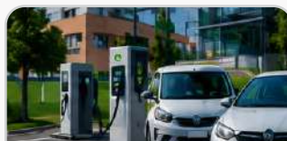
Hybrid and Alternative Fuel Vehicles